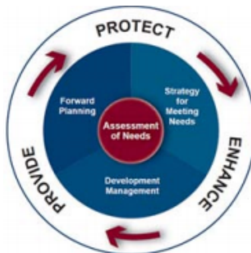
Figure 1: Sport England themes

To provide new playing pitch facilities that are fit for purpose to meet demands for participation now and in the future.