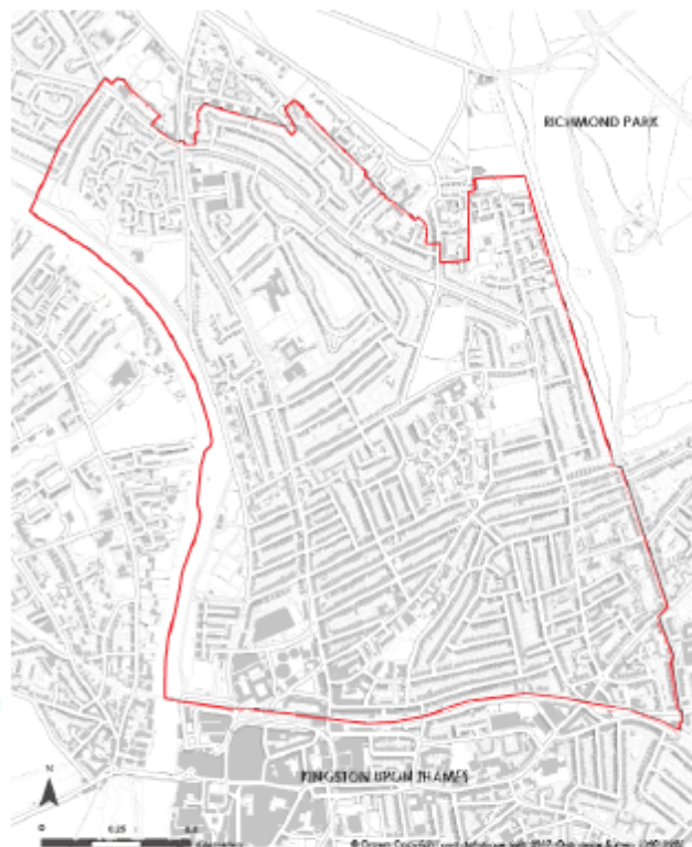
DESIGNATED NORTH KINGSTON NEIGHBOURHOOD AREA

If you have any questions about this application, please contact the Strategic Planning Team at: localplan@kingston.gov.uk or on 020 8547 5002.