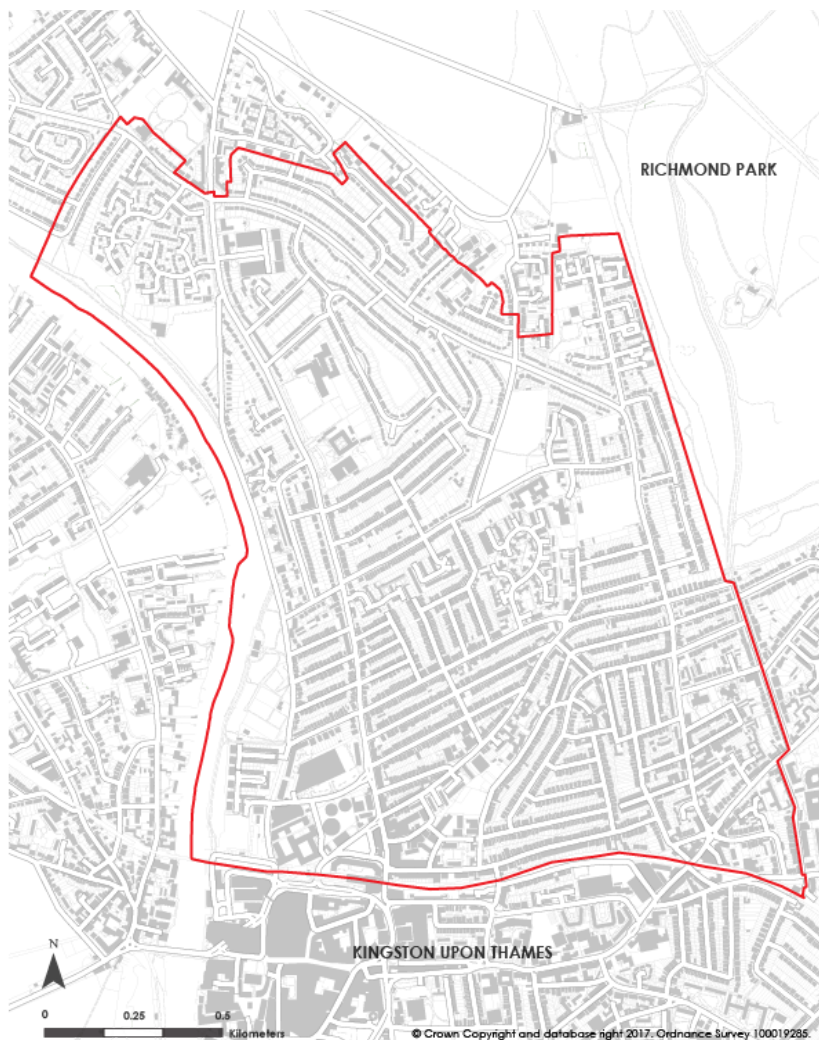
DESIGNATED NORTH KINGSTON NEIGHBOURHOOD AREA

Notice is hereby given that the Royal Borough of Kingston upon Thames, through a decision made on 30th March 2017 by the Director of Place, has designated the North Kingston Neighbourhood Area as applied for. The boundary of the area is shown edged red on the map below.