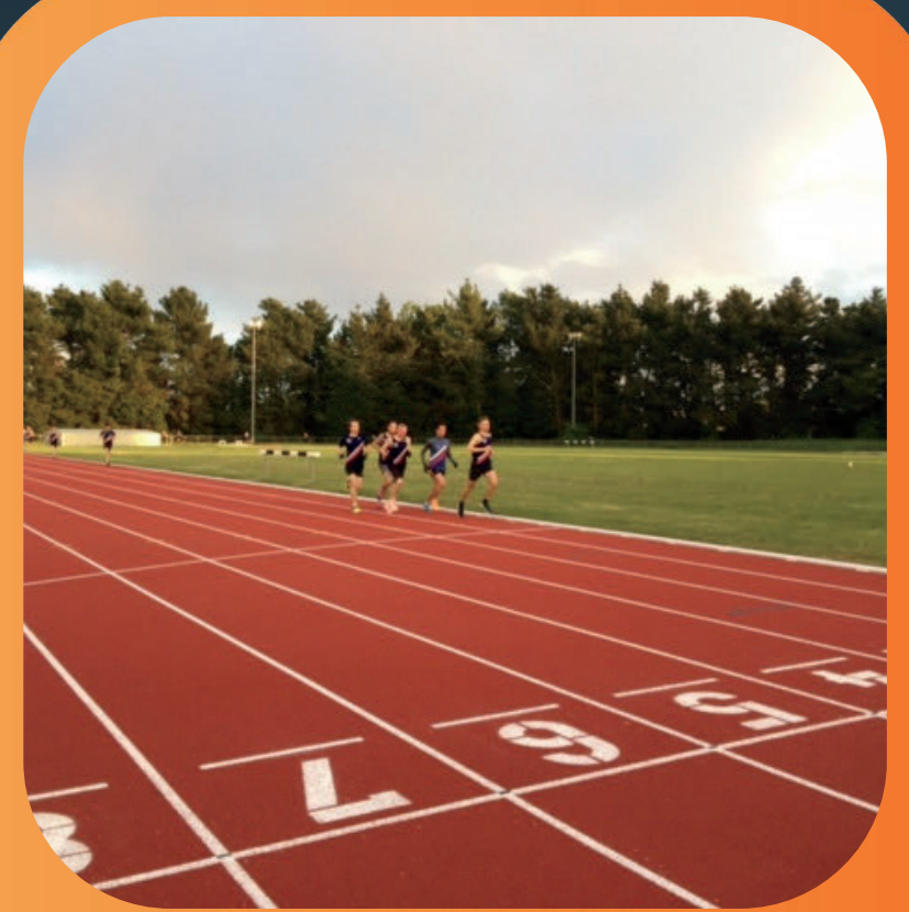
Weir Archer Athletics & Fitness Centre

We're passionate about helping you stay physically active and emotionally engaged in fitness, sport and wellbeing. Our mission is to put our heart and soul into creating active places and healthy people for communities to thrive