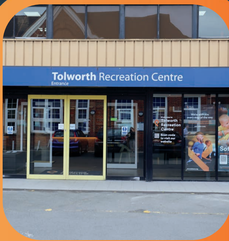
Tolworth Recreation Centre