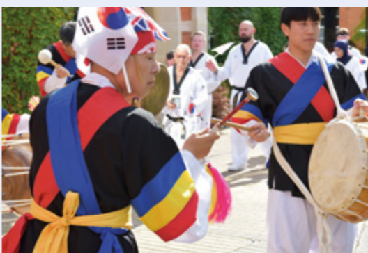
New Malden's new town square - set to be brought to life by community-led events