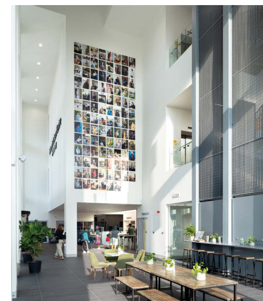
Images from the Britannia Leisure Centre in Hackney

The sudden closure of the much loved Kingfisher was unfortunate and completely unexpected, but the good news is that no matter where you live in the borough, you can look forward to using a fantastic new leisure centre, with first-class facilities, in 2024.